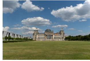
Camera: Sony α6600 Exposure: F6.3 1/4000sec ISO: 400