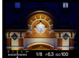
Simulated viewfinder image.