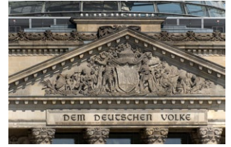
Camera: Sony α6600 Exposure: F6.3 1/3200sec ISO: 400