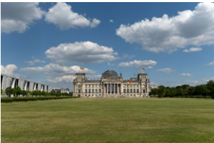
Camera: Sony α6600 Exposure: F6.3 1/4000sec ISO: 400