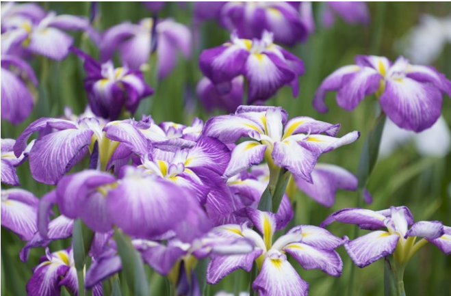
Camera: Sony α6600 Focal Length: 300mm Exposure: F6.3 1/200sec ISO: 100

The 18-300mm F/3.5-6.3 Di III-A VC VXD (Model B061) is an all-in-one zoom lens for Sony E, Fujifilm X, Canon RF, and Nikon Z APS-C mirrorless cameras. It is the first 1 lens in the world for APS-C mirrorless cameras with a zoom ratio of 16.6x and 18-300mm focal length range (27-450mm full-frame equivalent). This all-in-one zoom lens covers up to 300mm telephoto and is well-balanced with aspherical and special lens elements to achieve high image quality over the entire range. Plus, like most of TAMRON's other lenses for mirrorless cameras, the filter size is unified at 67mm. This all-in-one zoom lens makes photography more fun because you can use it in an unlimited number of situations. It's so versatile, it will inspire your creativity.