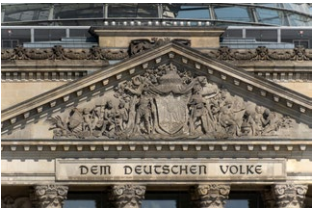
Camera: Sony α6600 Exposure: F6.3 1/3200sec ISO: 400

The 18-300mm F3.5-6.3 VC VXD autofocus provides speed, precision and responsiveness that ranks at the top of all-in-one lens category, due in part to TAMRON's VXD 3 linear motor focus mechanism. Even at the telephoto end of 300mm, it glides into focus comfortably from the minimum distance to infinity. The linear motor suppresses drive noise making this lens ideal for shooting both still photos and video in environments that demand silence.