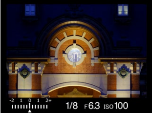
Simulated viewfinder image.