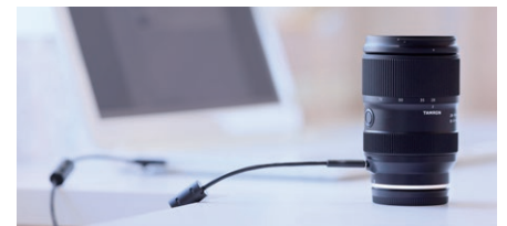
For Model A063

The 28-300mm F4-7.1 VC is compatible with the dedicated TAMRON Lens Utility software developed in-house by TAMRON. It lets users change lens settings, assign camera body functions and update firmware when available. In addition, functions unique to the mobile version can be operated remotely without touching the lens. Users may customize functions for various still and video shooting styles, providing a more personalized and fulfilling shooting experience.