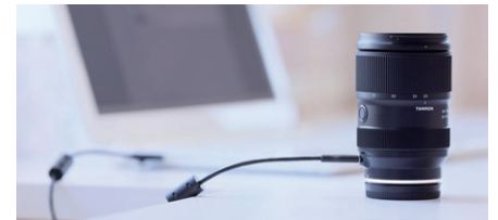
For Model A063

The 28-300mm F4-7.1 VC is compatible with the dedicated TAMRON Lens Utility software developed in-house by TAMRON. It lets users change lens settings, assign camera body functions and update firmware when available. In addition, functions unique to the mobile version can be operated remotely without touching the lens. Users may customize functions for various still and video shooting styles, providing a more personalized and fulfilling shooting experience.