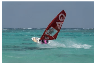
178mm F7.1 1/1250sec ISO 200 Camera: Sony α7R IV

The 28-300mm F4-7.1 VC is equipped with TAMRON's linear motor focus mechanism VXD 1 to deliver smooth and fast autofocus across the 10.7x zoom range, while the VC 2 mechanism suppresses camera shake for steady shooting. Now you are ready to go out with this one versatile lens for even an extraordinarily wide range of shooting situations.