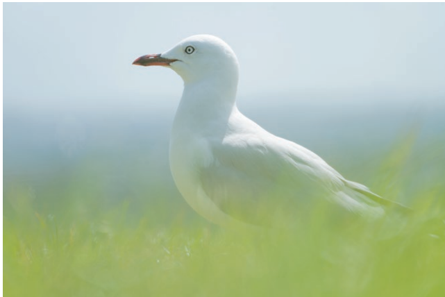
300mm F7.1 1/200sec ISO 100 Camera: Sony α7R IV