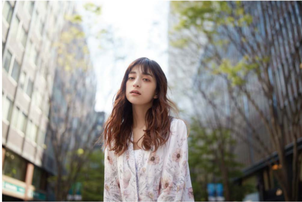
Focal Length: 35mm Exposure: F/1.4 1/800sec ISO: 100

To deliver a perfect image to people who love photography; that's our obsessive goal for all Tamron lenses. The Tamron SP 35mm F/1.4 Di USD (Model F045) is our most shining example. The exceptional image quality of this fast fixed focal lens makes it worthy of being the lens that marks the milestone 40th anniversary of the SP (Superior performance) Series. We wanted to know what kind of lens would result if we focused our accumulated expertise and technologies purely on lens performance in pursuit of image quality. In other words, could we create the greatest Tamron lens ever? All of Tamron's technical competence and new coating technologies have been compounded to finally complete the finest lens in Tamron's history. Uncompromising resolution at wide-open aperture combines with Tamron's distinctive bokeh and superior handling characteristics. Experience its performance for yourself. It will give you a better way to see the world.