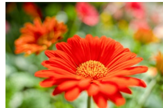
Focal Length: 28mm Exposure: F2.8 1/320sec ISO: 100

At 28mm, the MOD (Minimum Object Distance) is 0.19m (7.5 in) with a magnification ratio of 1:3.1; at 200mm the MOD is 0.8m (31.5 in) with a magnification ratio of 1:3.8. Capture stunning close-up images and leverage the bokeh utilizing a large F-number and enjoy unique close-ups that were not possible with all-in-one zoom lenses until now.