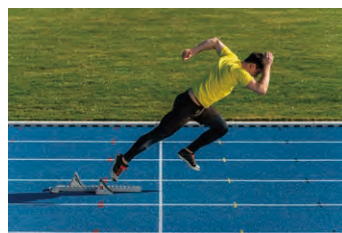
Focal Length: 150mm Exposure: F5.6 1/2000sec ISO: 500