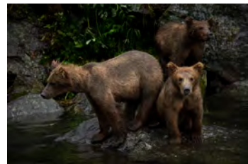
Focal Length: 150mm Exposure: F6.3 1/1000sec ISO: 6400

When shooting in the ultra-telephoto range, even the smallest vibrations can lead to loss of image clarity. The 150-500mm F5-6.7 is equipped with VC functionality to support sharp images despite unavoidable camera shake. VC delivers powerful support for handheld shooting of scenes with low light levels, such as at evening and indoor, without the use of a tripod. The lens also features a VC mode selection switch with three modes including a dedicated panning mode, thereby enabling selection of the ideal VC mode to match shooting conditions and preferences.