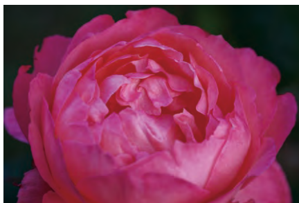
Focal Length: 150mm Exposure: F8 1/100sec ISO: 400

The 150-500mm F/5-6.7 Di III VC VXD (Model A057) features a very compact design, high image quality. This amazing zoom lens achieves a 500mm focal length while retaining a compact size, with a length of just 209.6mm (8.3 in) and a maximum diameter of 93mm, and is equipped with VC (Vibration Compensation), so it's easy to carry and comfortable to shoot handheld. The design places major emphasis on image quality. The optical construction features 25 elements in 16 groups and utilizes special lens elements and hybrid aspherical lens elements to control chromatic aberrations. BBAR-G2 1 Coating is used to suppress ghosting and flare, which could otherwise occur under backlit conditions. Additionally, the lens has a MOD (Minimum Object Distance) of 0.6m (23.6 in) at the 150mm end, so you can freely enjoy telephoto macro shooting of subjects at closeup distances. The 150-500mm F5-6.7 is a highly versatile lens that lets you capture a wide array of subjects ranging from landscapes and birds to sports and wildlife. You'll be thoroughly amazed when you experience the powerful and unique world of ultra-telephoto lenses for yourself.