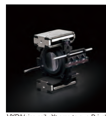
VXD(Voice-coil eXtreme-torque Drive): linear motor focus mechanism

The 150-500mm F5-6.7 zoom's AF drive system is equipped with the VXD 2 linear motor focus mechanism. The VXD mechanism delivers extreme high-speed and high-precision movement and ensures exceptionally responsive performance when photographing subjects such as wild birds, sports, vehicles, and wildlife in general. The linear motor also suppresses drive noise and vibrations during focusing, making it ideal for shooting both still photos and video in environments that demand quietness.